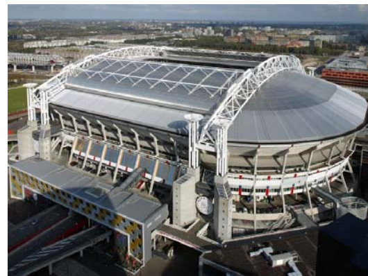
Figure 2: Roof of the Amsterdam Arena, made of Lexan solar control IR@ [Sabic Innovative Plastic]

The material polycarbonate (PC) is an amorphous, technical thermoplastic, which is distinguished by its high level of transparency as well as its strength and rigidity. By virtue of its outstanding toughness, PC is one of the few polymeric transparent construction materials that tolerates high impact stresses. Polycarbonate is therefore used as a glass substitute in applications where high resistance to breakage is critical, e.g. motorcycle helmet visors, sports goggles, and in medical engineering.